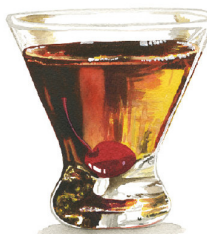
MANHATTAN 57% WHISKY | SWEET RED VERMOUTH | BITTERS | ON THE ROCKS | LOWBALL GLASS

Broker's Gin, Campari, Carpano Antica Vermouth, Orange Slice - So Nice!