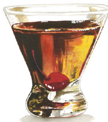
MANHATTAN 87% WHISKEY | SWEET RED VERMOUTH | BITTERS | ON THE ROCKS | LOWBALL GLASS

Broker's Gin, Campari, Carpano Antica Vermouth, Orange Slice - So Nice!